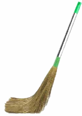
Grass Broom (Steel)