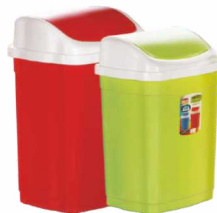
Plastic Push Bin