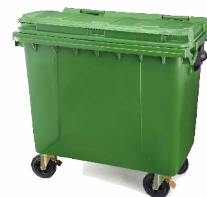
Wheeled Dustbin - 1100 Ltr