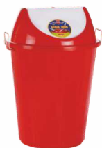
Plastic Swing Bin