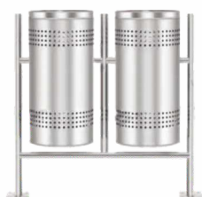
Pole Mounted SS Dual Bin