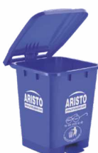
Plastic Pedal Bin