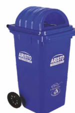
Wheeled Dustbin - 90 Ltr