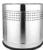
SS Planter Bin