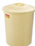
Plastic Plain Bin