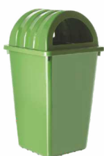
Waste Bin with Dome