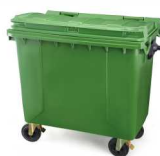
Wheeled Dustbin - 660 Ltr