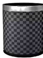
Modern Luxury Dustbin