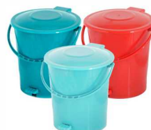
Plastic Pedal Bin