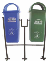
Pole Mounted Dual Bin