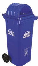
Wheeled Dustbin - 120 Ltr