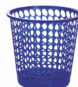
Plastic Perforated Bin