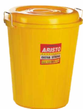
Drum with Lid