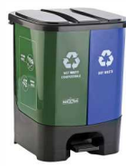
Duo Bins with Lid