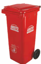
Wheeled Dustbin - 240 Ltr