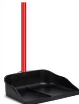
Plastic Dustpan with Stick