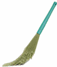
Dust Free Broom