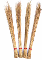
Hard Broom (Industrial)