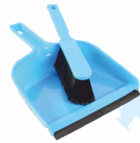
Plastic Dustpan with Brush